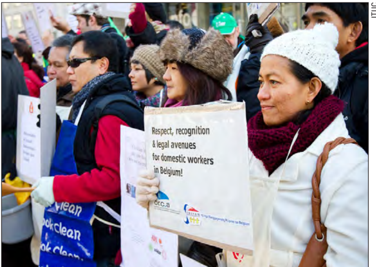
Trade unions rally in support of Convention 189 outside the European Parliament in Brussels.

As a northern European country with a relatively large informal economy, Belgium's titres-services system is seen as a resounding success, having so far created 125,000 jobs, and above all, having helped workers transition from the informal to the formal economy. Yet many of the (mostly female) workers in this sector are still in a precarious situation – particularly those who don't get enough working hours because competition is so fierce.