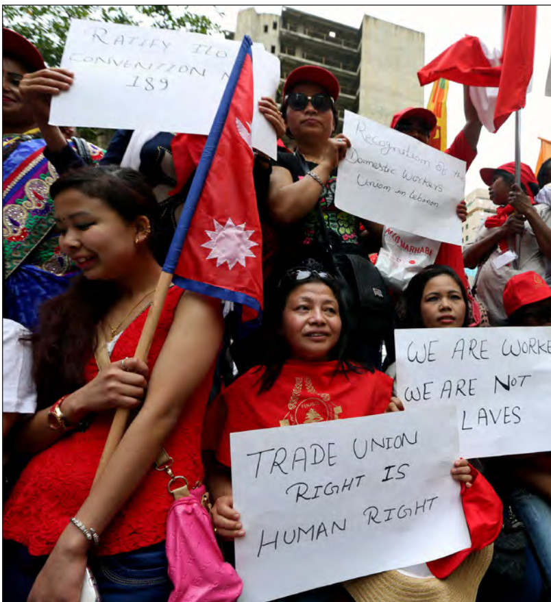
ILO Convention 189 still as not been ratified by the Lebanese government.

On 1 May 2016, domestic workers from Nepal, the Philippines and Ethiopia marched side by side with Lebanese trade unionists, holding placards demanding the implementation of Convention 189. The Domestic Workers' Union currently has between 500 or 600 members, although some members – frustrated by the slow pace of change to their working conditions – recently left. But for those domestic workers who remain with the union, training is a key part of their membership. "We of-