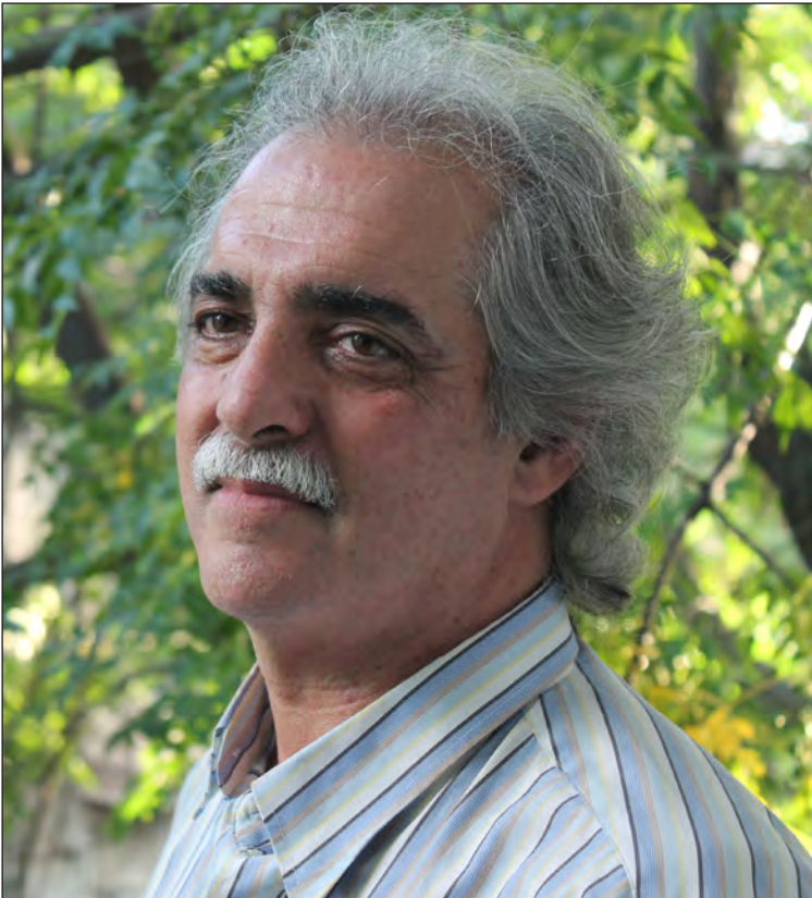
Uruguayan writer Igancio Martínez says all artists should be covered by the country's social protection laws.

ed into the national social security system. This allowed those who could not previously pay their taxes to be listed and protected contributors to the system by paying a small amount of money, the so-called monotributo [25 b].