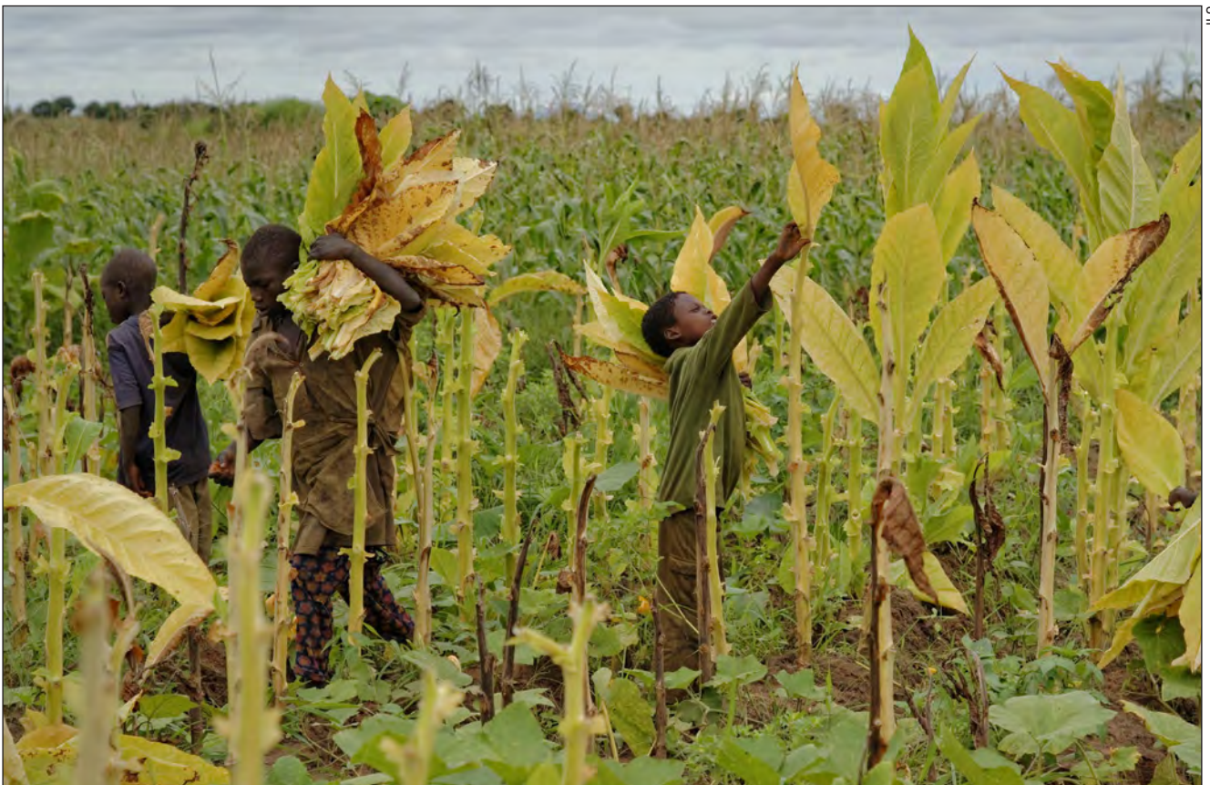
Young children in Kasungu, Malawi harvest tobacco.

The announcement follows extensive consultations with the International Labour Organization (ILO) last year, the same year the global labour body adopted Rec-